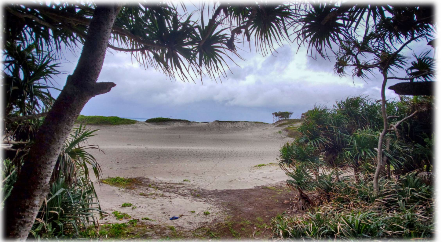
View from the pandanus trees

Pandanus leaves are used for handicrafts. Artisans collect the leaves from plants in the wild, cutting only mature leaves so that the plant will naturally regenerate. The leaves are sliced into fine strips and sorted for further processing. Weavers produce basic pandan mats of standard size or roll the leaves into pandan ropes for other designs. This is followed by a coloring process, in which pandan mats are placed in drums with water-based colors. After drying, the colored mats are shaped into final products, such as placemats or jewelry boxes. Final color touch-ups may be applied. AND you can eat the fruit.